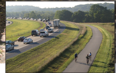
MONTGOMERY COUNTY, PENNSYLVANIA